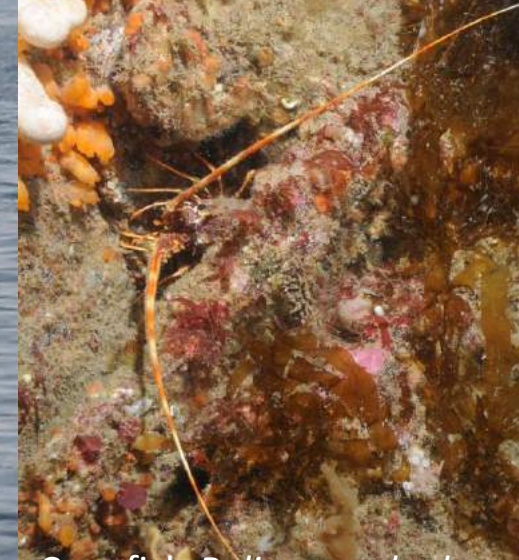
Crawfish Palinurus elephas Hilsea Point Rock