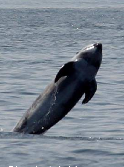
Risso's dolphin Mounts Bay