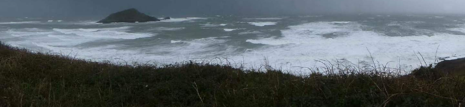
Impacts of weather events