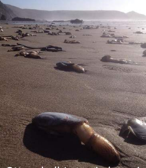
Otter shell Lutraria lutraria Whitsand Bay