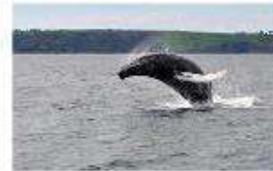
Sightings of the humpback whale inshore off South Devon in the Spring for several weeks raised huge interest.