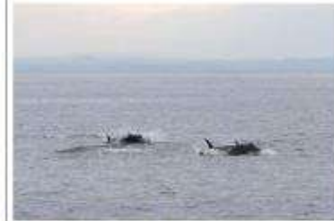
Blue fin Tuna continued to be seen often in 2017. School of blue fin tuna – Tom Horton