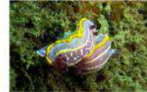
This sea slug Nembrotha kribbi was recorded for the first time on the north side of the English Channel in 2017; here at Portkennis.