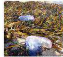
Strandings of the Portuguese Man O'War Physalia physalis in summer were very common in 2017; these were on the Isles of Scilly, Thomas Porth.