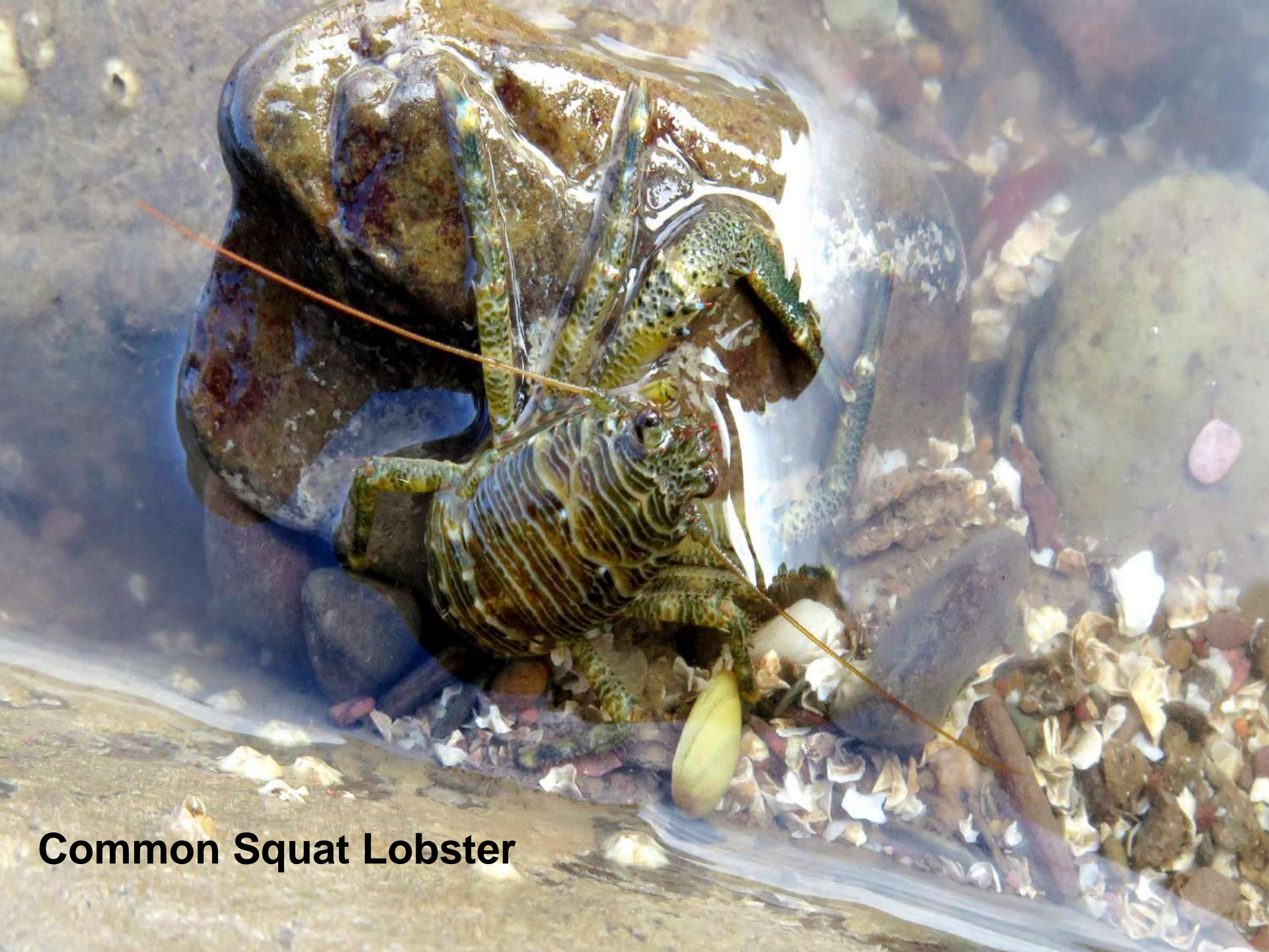
Common Squat Lobster