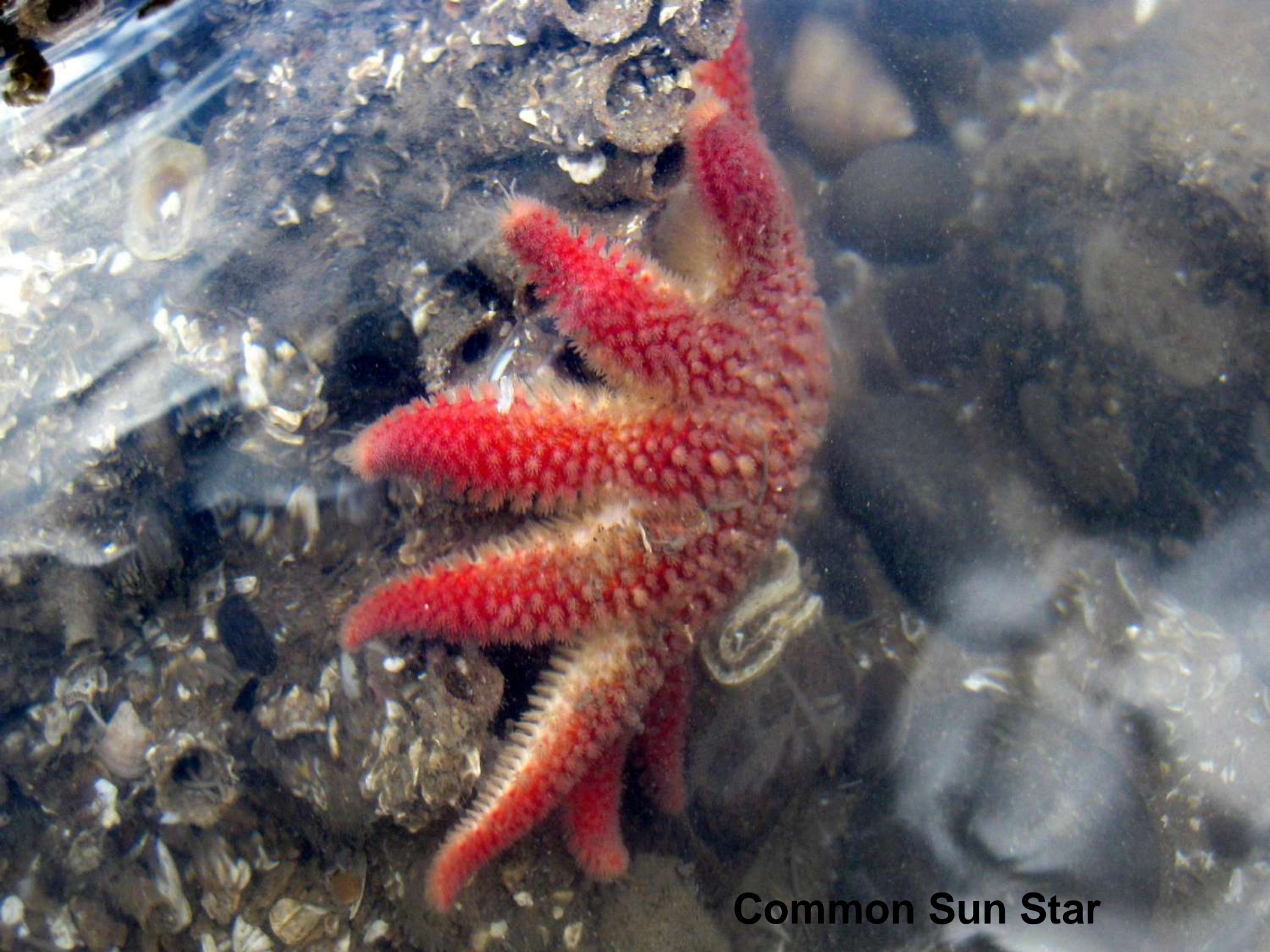
Common Sun Star