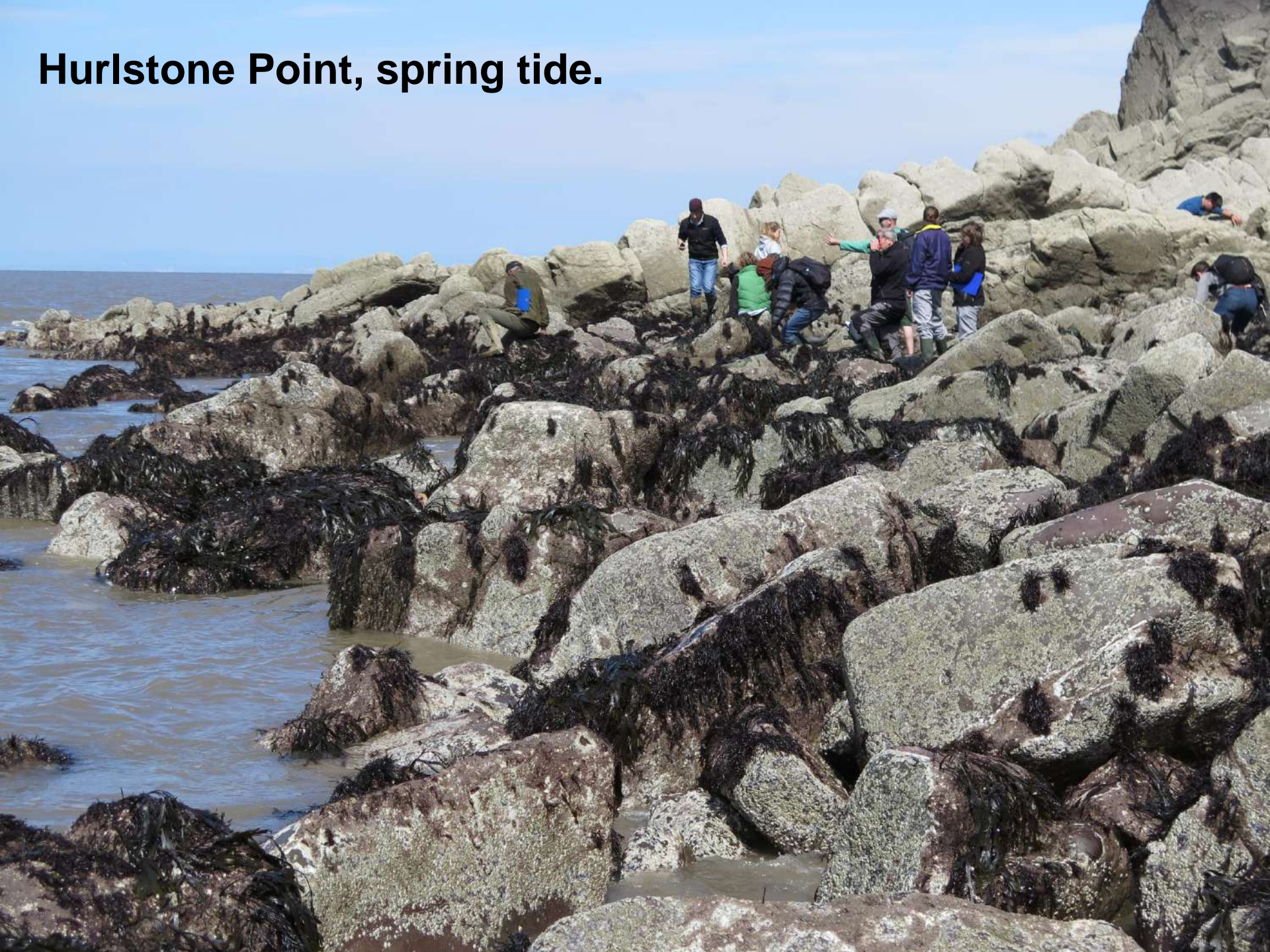
Hurlstone Point, spring tide.