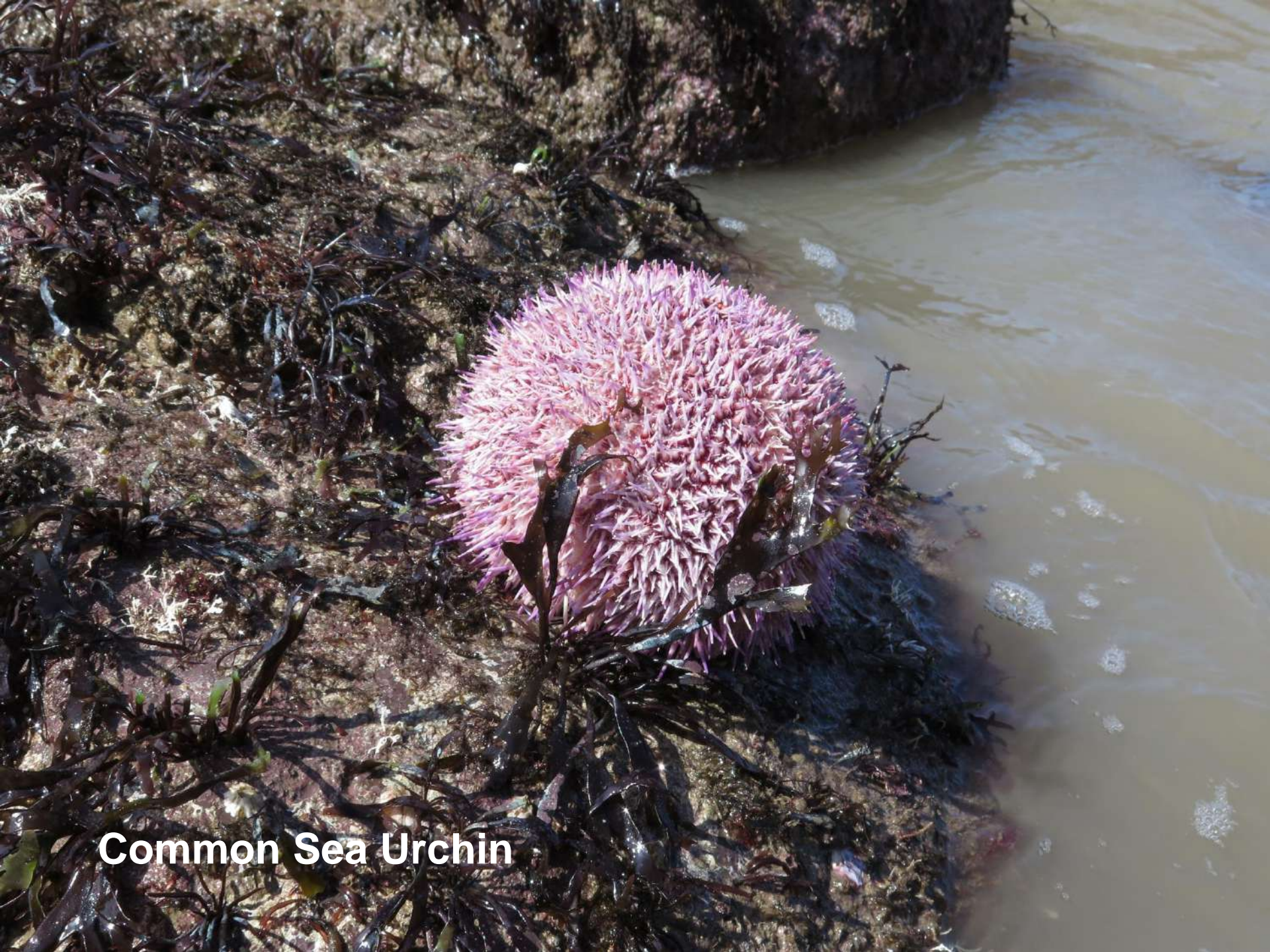
Common Sea Urchin