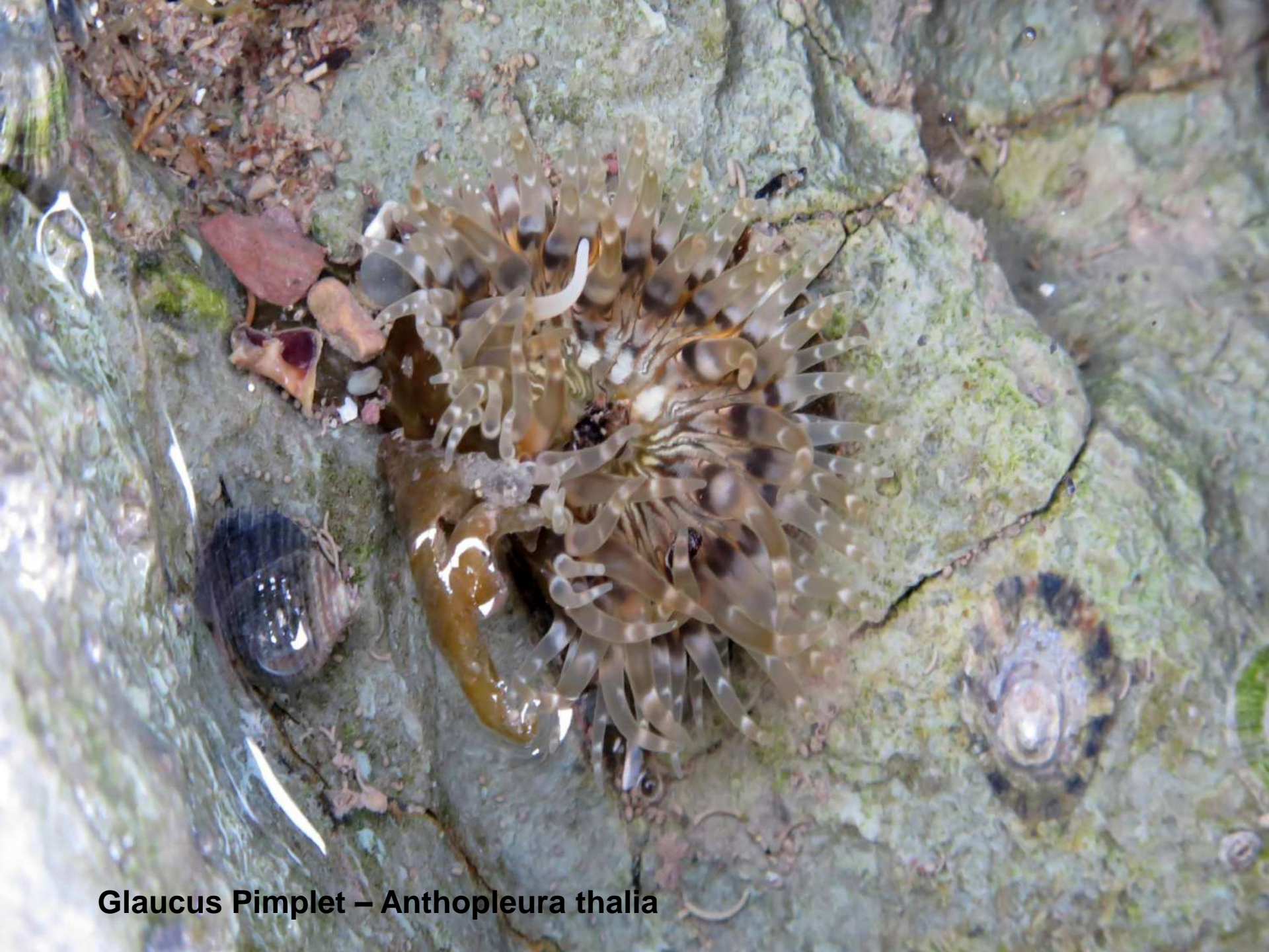
Glaucus Pimplet – Anthopleura thalia