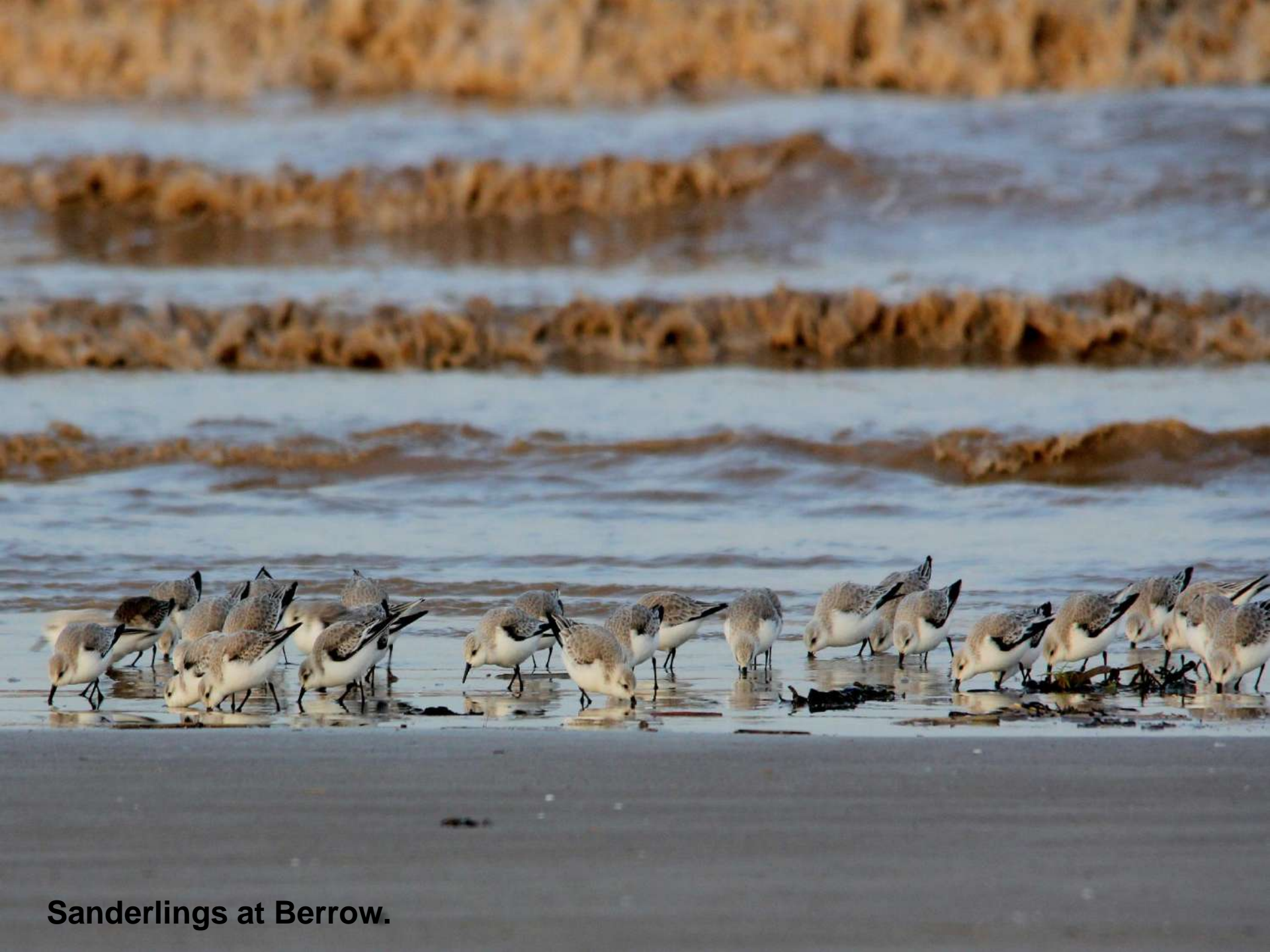
Sanderlings at Berrow.