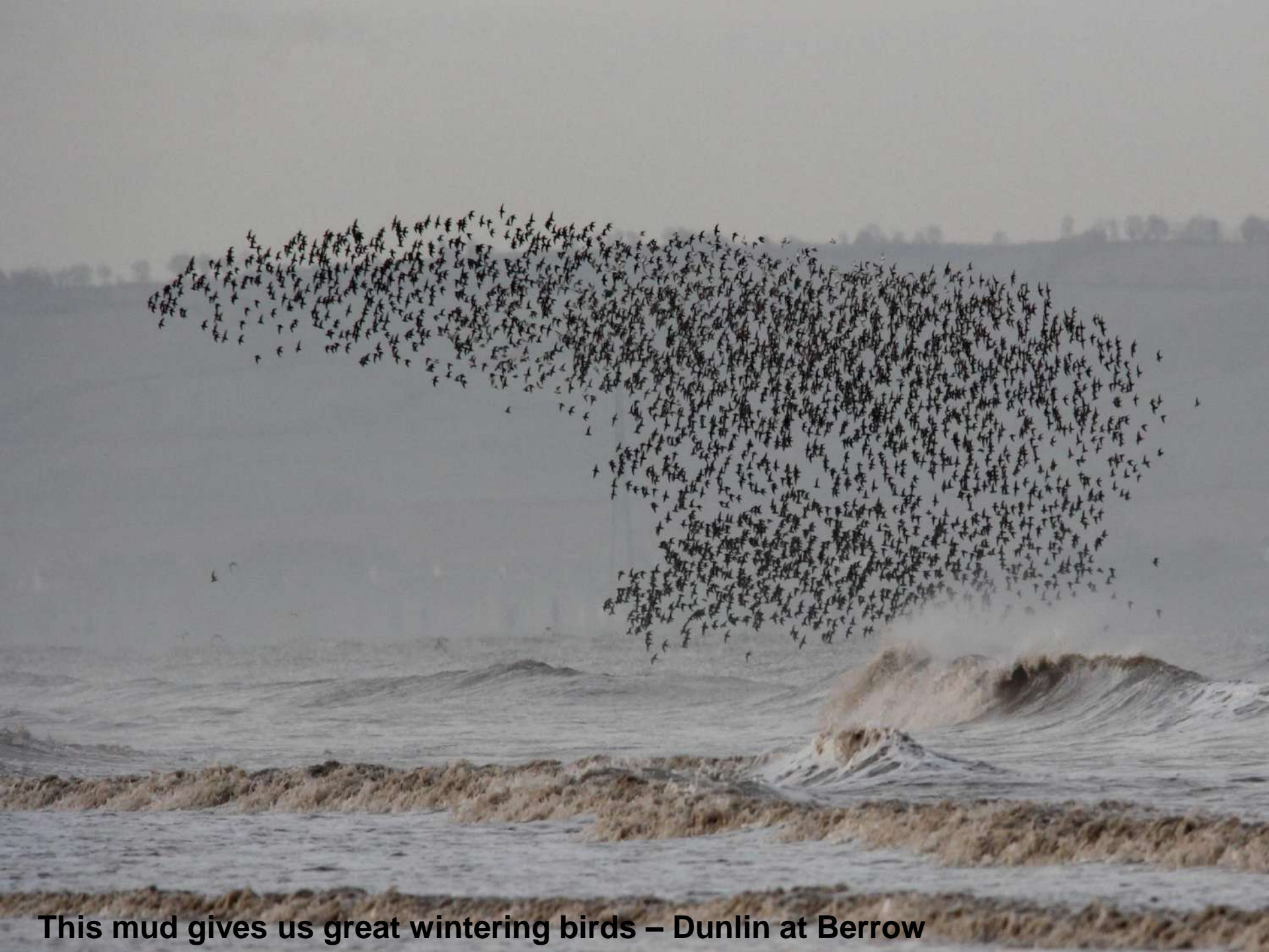
This mud gives us great wintering birds – Dunlin at Berrow