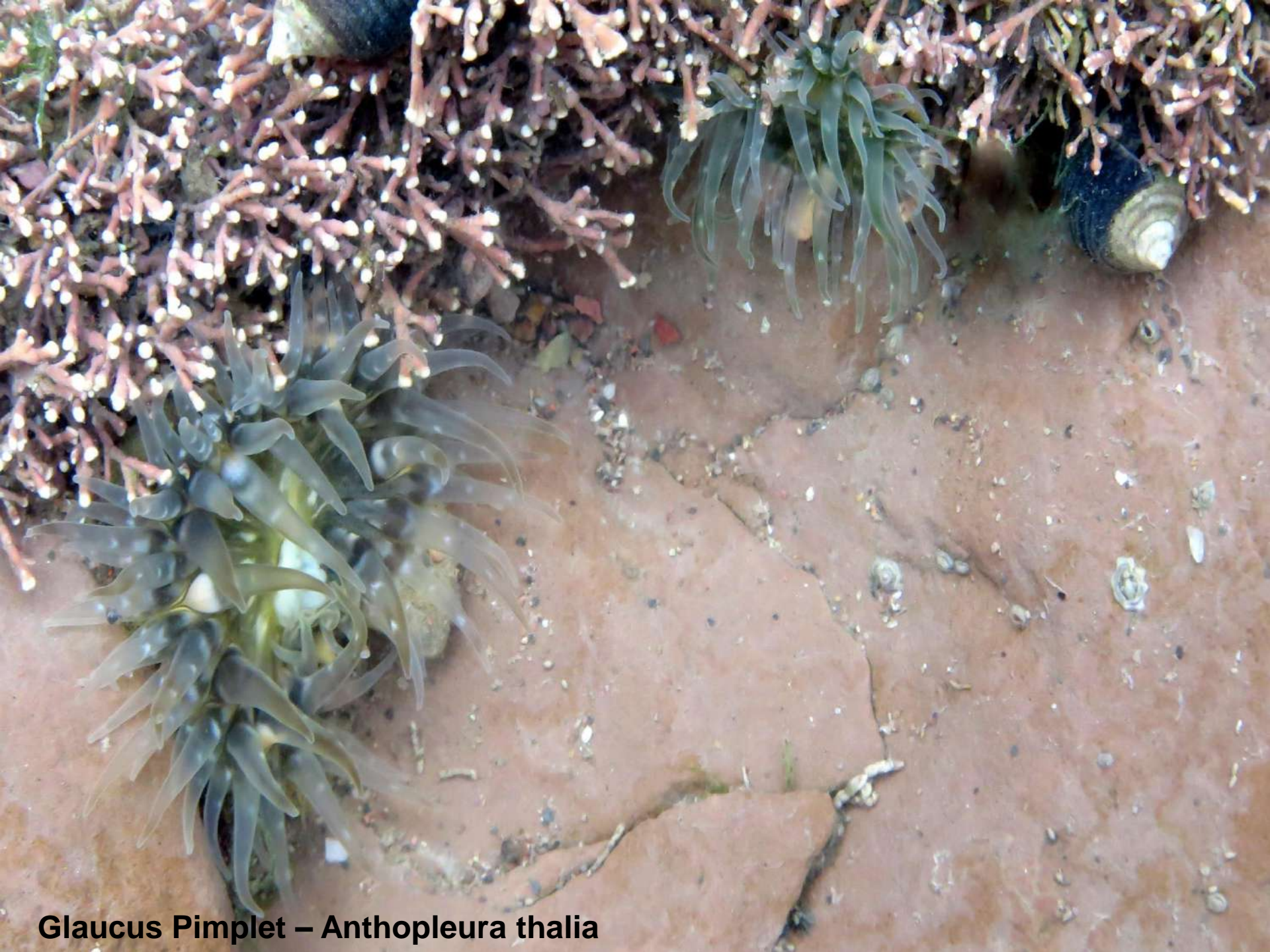
Glaucus Pimplet – Anthopleura thalia