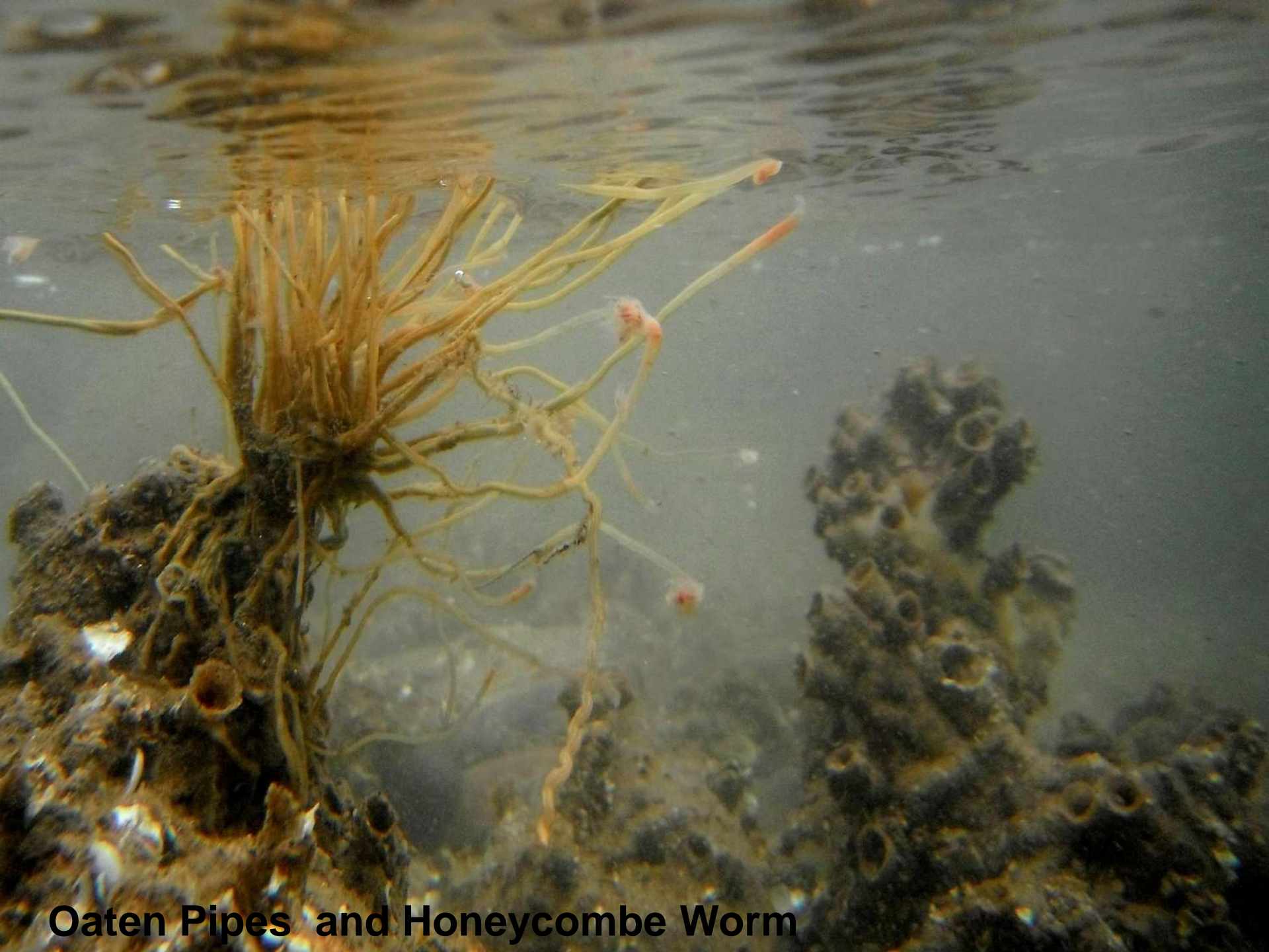
Oaten Pipes and Honeycombe Worm